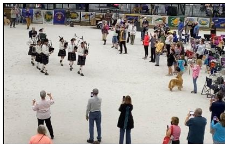
Bagpipers escort Best of Breed Judge