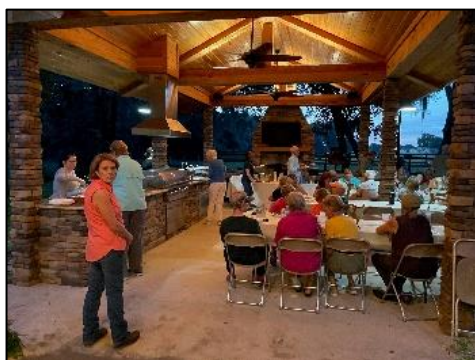
Field welcome dinner