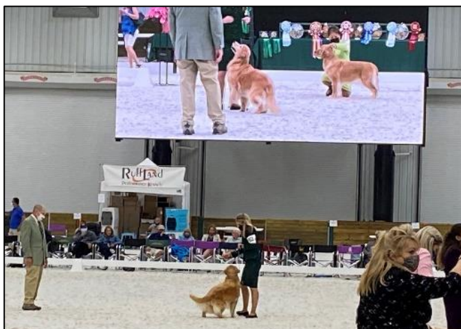
Spectators could watch conformation judging on big screens