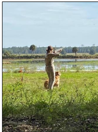
Hunt test action