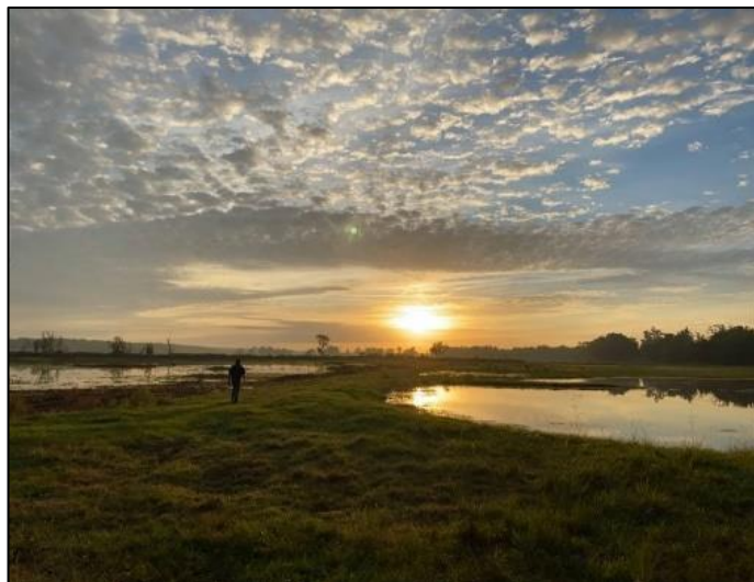
Sunrise at Lazy J Ranch before the Hunt Test