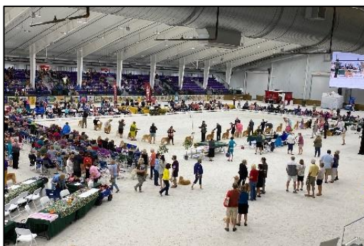
Best of breed judging