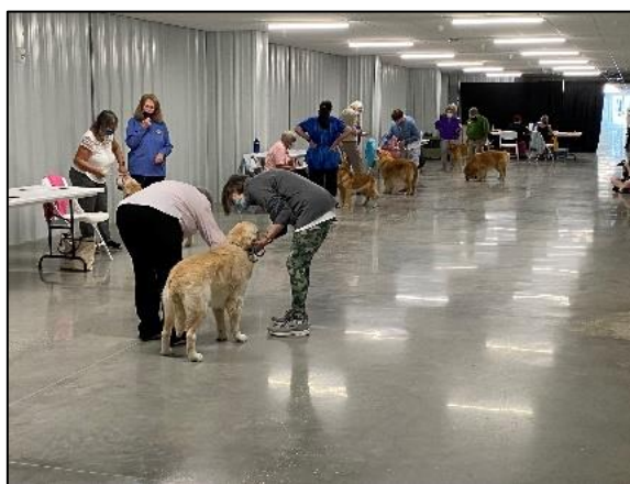
CCA in progress