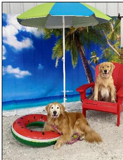
Fun photo from one of the photo op areas