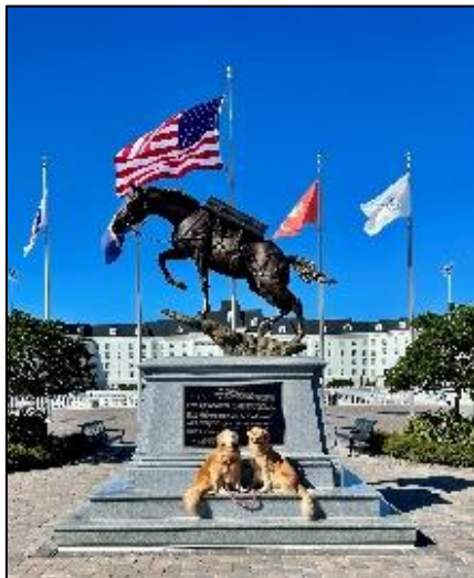
Photo op area