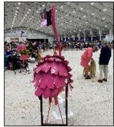
Flamingos brought a Florida feel to the breed ring