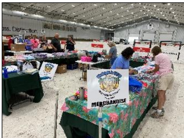
2021 specialty merchandise area