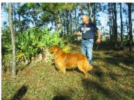
Tracking In Port St. Lucie