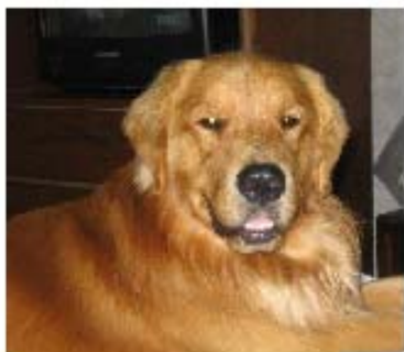
Here's Looking At You