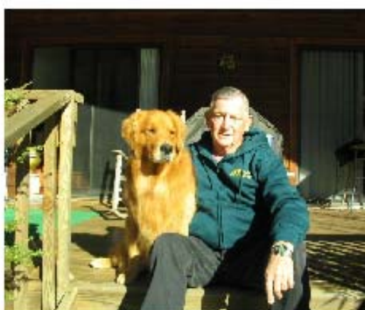
Me and My DAD