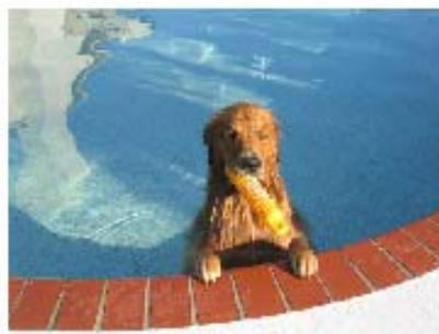
I Love My Pool