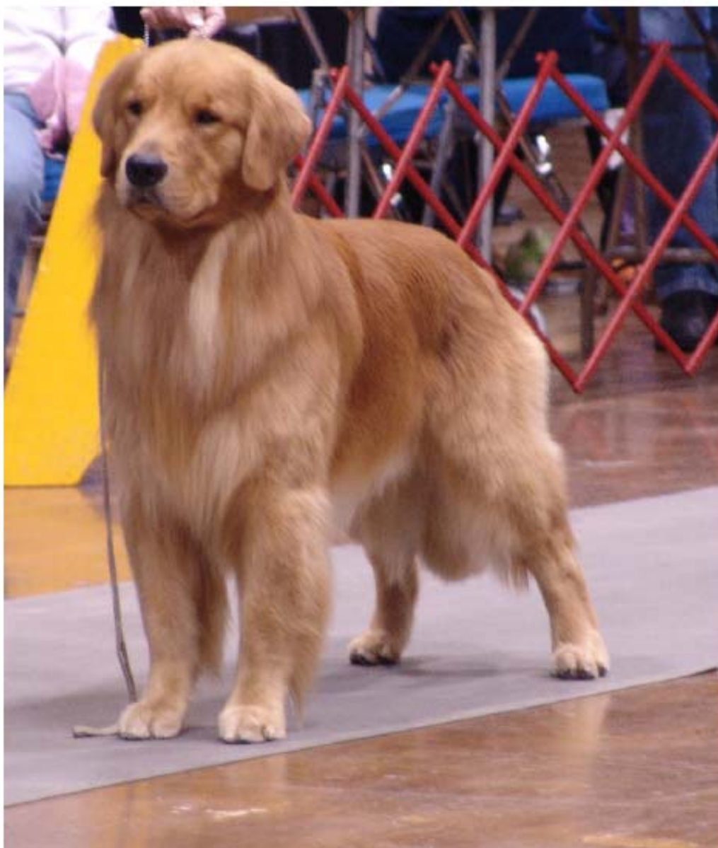
INTL. CH - COMPASS GOLD POINTS TO JAKE - TD, CDC