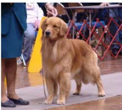
Conformation Show In Maryland