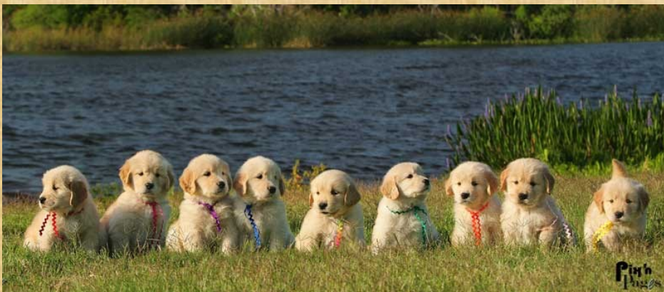
Dallas's First Litter