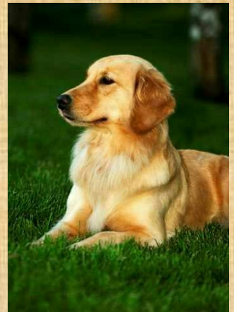
Dallas (Ch Gemini's Lone Star Belle, CD, MX, MXJ, OD, BISS)

This last question is the hardest because what I would change in the sport of dogs can't really be changed. I've thought about it for years and come to the conclusion that I'll just have to live with it and keep trying to breed a better dog. You can't keep a good dog down all the time.