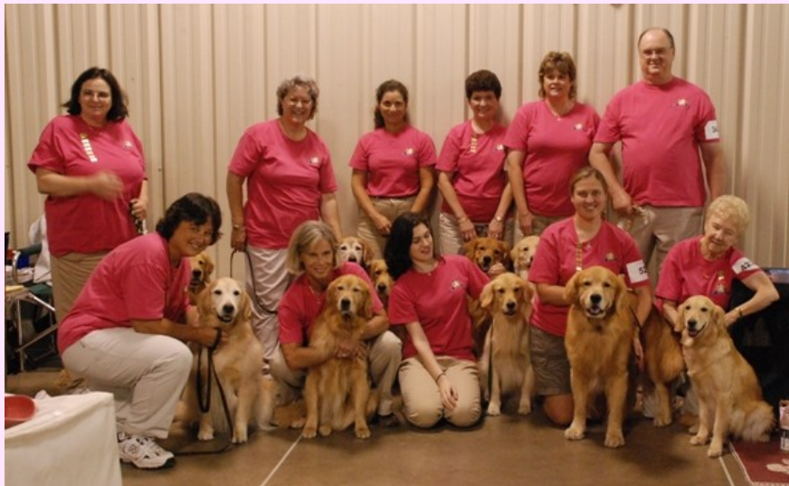
2010 DOCOF TEAM