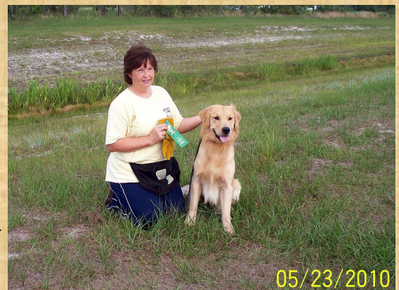
Alexander after earning his TD

Tell us about your dogs and their accomplishments. I have 4 dogs now, and they all have their TDs. Ziggy was our first TD, he hates showing in obedience but loves training in it - except for stays. He loves agility. He has his RE, TD, AXP, OJP, OFP. Henry is Ziggy's half brother. He has his UD, RE, TD, is doing some field work, and some agility, but we are still working mainly in obedience. Micah, has earned his VCD1 (CD, NAP, NJP, TD) and his RN and NFP. A few weekends ago, he earned his OJP. Hopefully this summer will work on his CDX. We are also training TDX work. Alexander has earned his TD (first time out at 13 months), his BN (Beginners Novice) and RN. He is training mostly in obedience and tracking, (VST), with some agility thrown in.