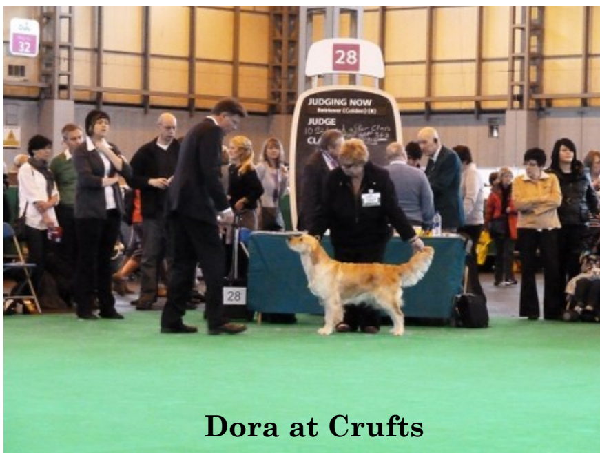
Dora at Crufts