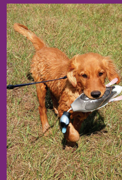
Marshall Matt Dillon