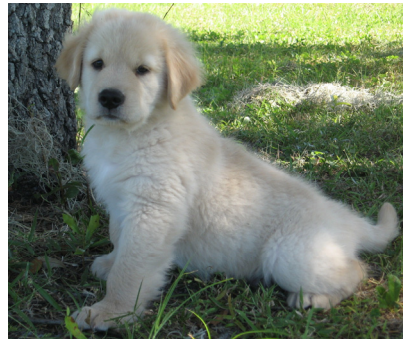
Levi at 8 weeks