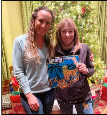
Versatility Award: Cody Karyn Angel (second consecutive)