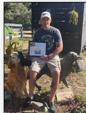
Billy Kling Award of Appreciation