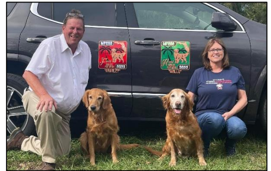
Field Dog of the Year: Scarlet

OTCH5 Hi-Star Stealin' All The Thunder UDX16 OGM BN GO RN