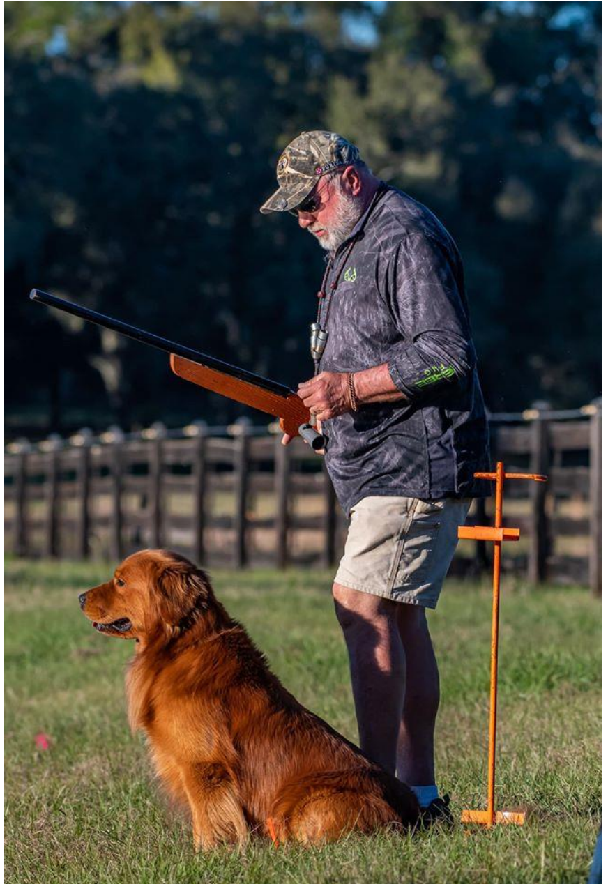
Grady in Senior

The Mid-Florida Golden Retriever Club staged another successful edition of the annual Spring Hunt Test February 8-9 at Golden Oaks Ranch in Montverde, FL.