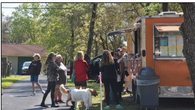
The Camino Tacos truck was a big hit