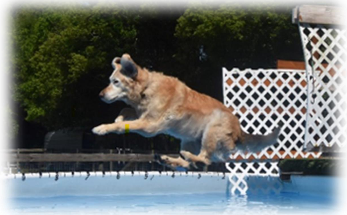
Karyn Angel's boy Cody flies off the dock