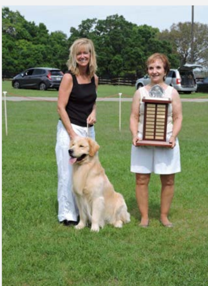
BEST IN MATCH