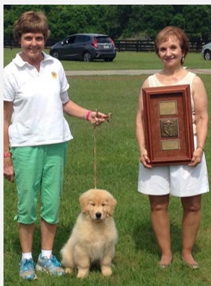
BEST PUPPY IN MATCH