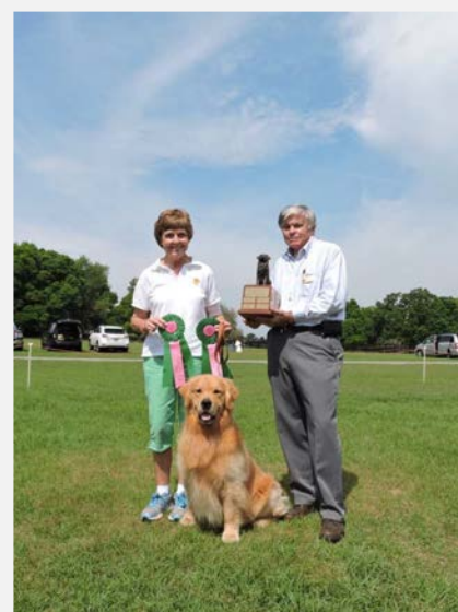
OBEDIENCE—HIGH IN MATCH