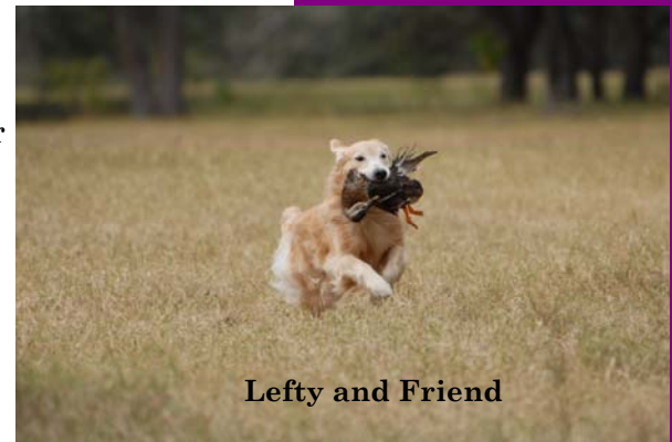
Lefty and Friend