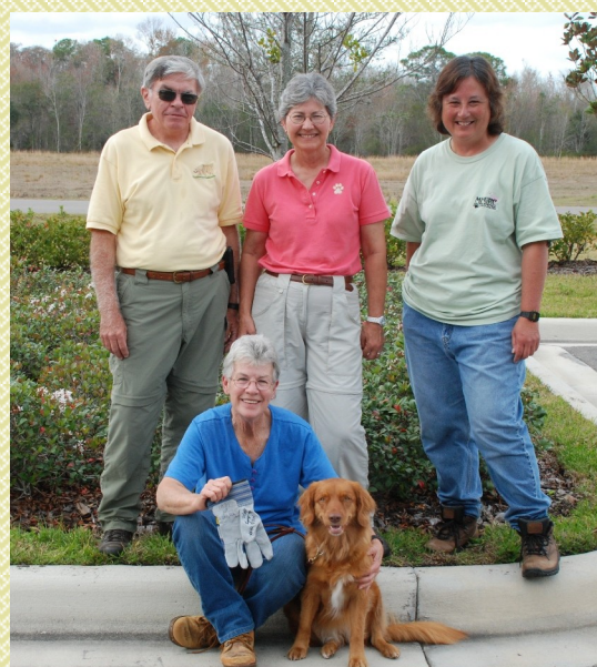
A Toller earns his too!